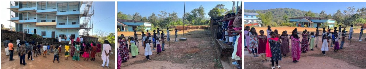
Taking pledge on the 100 th campaign day of TB eradication

TAKING PLEDGE ON 100 DAYS CAMPAIGN ON TB: On 13 January, In pursuance of the OM dated 9 January 2025 from the Dist. TB Officer Wayanad received through the Dy. Director of Education, a special assembly was arranged by Headmaster Incharge and the whole attendees took pledge as a part of 100 days campaign to eradicate Tuberculosis (TB) from this district, the one among the 347 districts marked at National level. Prior to taking pledge, headmaster himself briefed on this infectious disease Tuberculosis (TB) that is caused by the bacteria Mycobacterium tuberculosis and is a contagious disease that spreads through the air when an infected person coughs, sneezes, or spits.